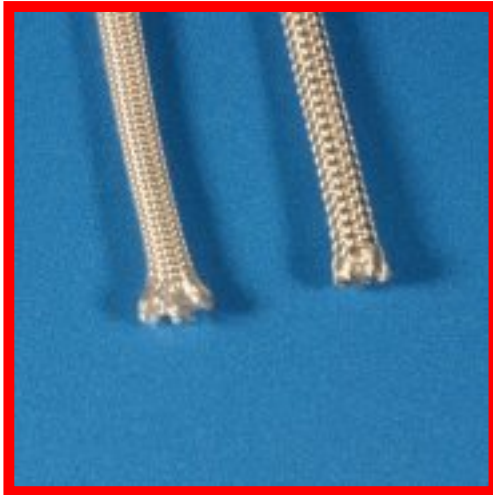
Left: Standard Wall Thickness Right: 1/32" Heavy Wall Thickness

Heat Treated or Heat Treated with Binders